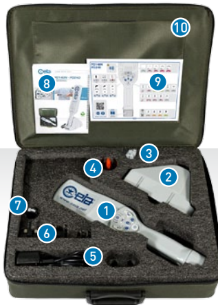
PD140N Set inside the Carry Bag