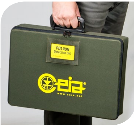
☑ PD140N Hand Held Detection Set with carry bag