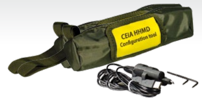
HHMD Configuration tool