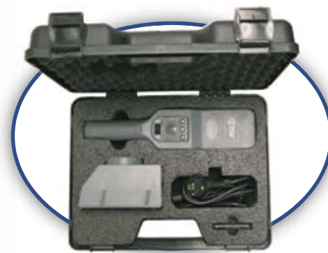
V140 Carrying Case

The special shape of the sensitive surface makes operation of the device easy, unlike other portable metal detectors