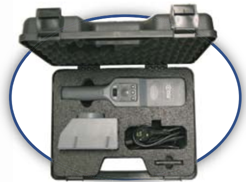
V140 Carrying Case

The special shape of the sensitive surface makes operation of the device easy, unlike other portable metal detectors